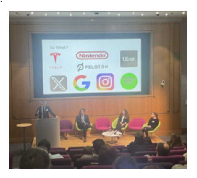
discussing AI and decision making in trauma

that in some cases machines will be more reliable than humans?