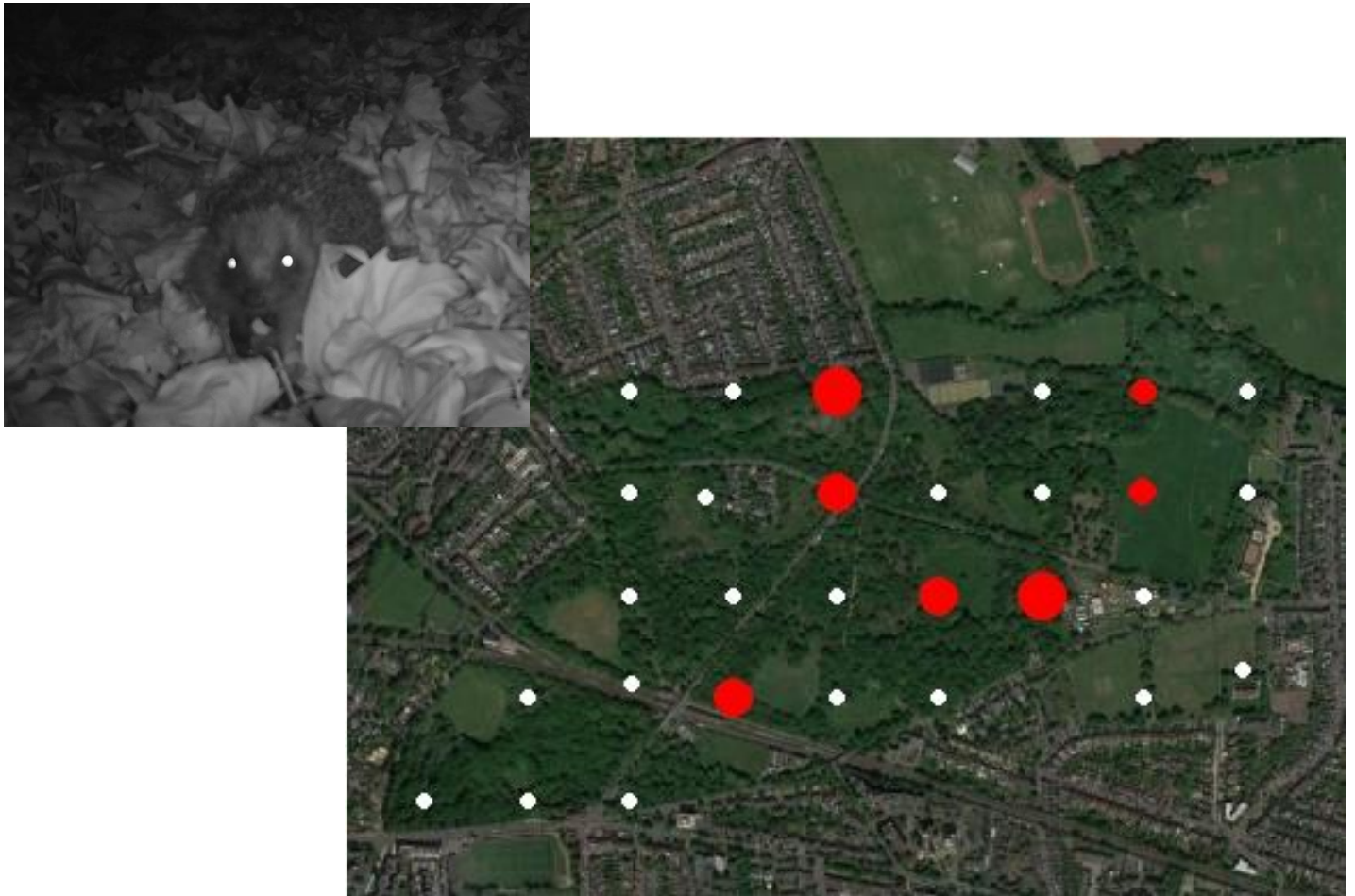
Figure 3: Map showing the sites where the camera captured Hedgehog sequences. Red indicates presence and white absence. Trapping rates (the total number of hedgehog sequences taken by the camera/ number of days the camera was active) ranged from 0 to 0.19. Larger circles indicate higher trapping rates.

Hedgehogs were seen at six camera sites, with 19 sequences in total (Figure 3). Hedgehog presence is indicated by a red circle and absence with a white circle. Larger red circles indicate a higher trapping rate (although the actual difference in rates between sites was small).