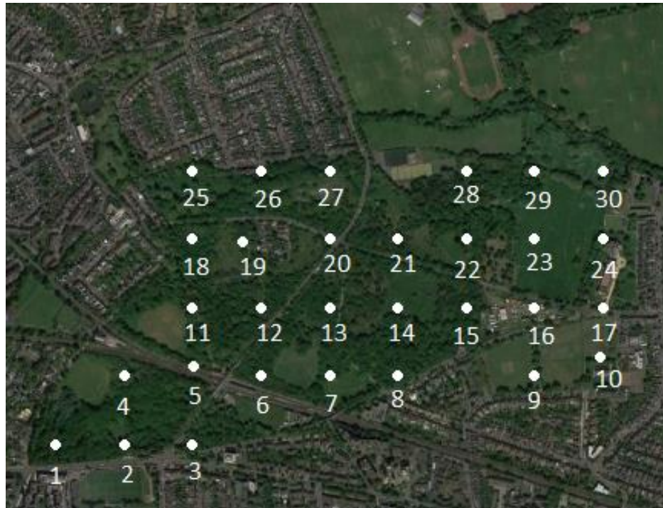
Figure 1: Map showing camera sites, site coordinates are provided at the end of the report.

For parks where a high number of hedgehog sequences are recorded, the camera trap survey method facilitates the use of a statistical technique known as Random Encounter Modelling to estimate the population density of a species 4 . Unfortunately, in this case too few hedgehog sequences were captured to do this. However, we were able to provide estimates of distributions along with anecdotal records of hedgehog presence in the surrounding region.