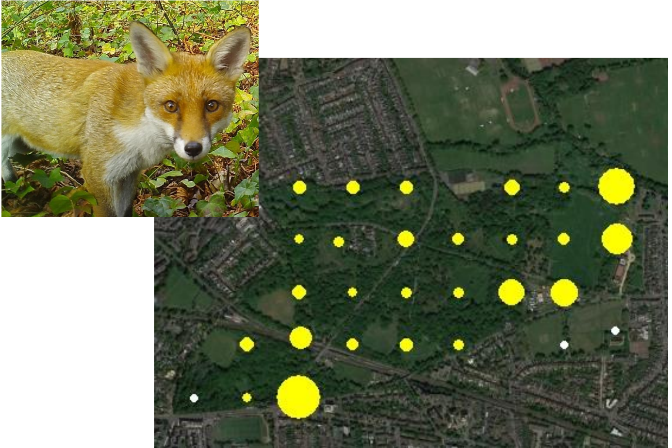
Figure 5: Map showing the sites where the camera captured Fox sequences. Yellow indicates presence and white absence. Larger circles indicate higher trapping rates (though not directly comparable to the previous species maps). Rates ranged from 0-4.29.

Foxes were the most common species to be detected by the cameras, with 499 sequences over 26 sites (Figure 5). The size of the circle indicates trapping rate, however, as the scaling in this map is different to that of the hedgehog and badger, the map symbols are not comparable between species.